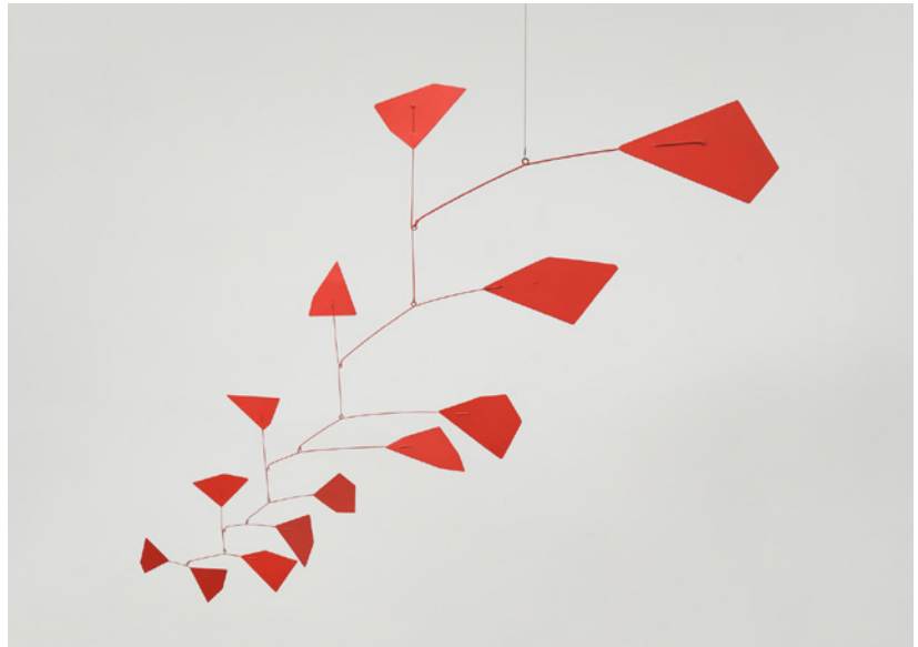
Left: Portrait of Calder, c. 1930. Right: Alexander Calder, Untitled, c. 1952.

Philadelphia, PA — February 20, 2020—A new sanctuary dedicated to the art of Alexander Calder, one of the most innovative artists of the 20th century, will be created in the heart of downtown Philadelphia. Herzog & de Meuron has been selected to design the new cultural facility, which will feature bespoke galleries and gardens presenting a rotating selection of masterworks from the Calder Foundation, including mobiles, stabiles, monumental sculptures, and paintings. The nonprofit initiative, which will be formally named in the coming months, has been launched by a group of Philadelphia philanthropists working in collaboration with the Calder Foundation and in partnership with the City of Philadelphia and the Commonwealth of Pennsylvania.